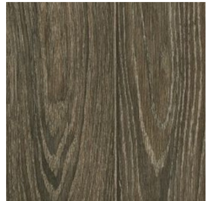
OAK LANDING - BRAZILNUT 37518-271