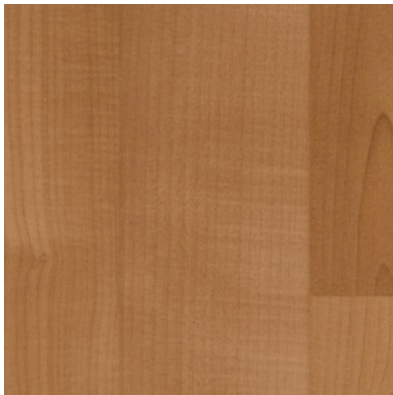
MAPLE KNOCK KNOCK 37501-271