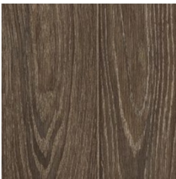
OAK LANDING - ACORN 37519-271