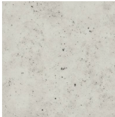
SOLIDIFIED SALTED CONCRETE 37509-271